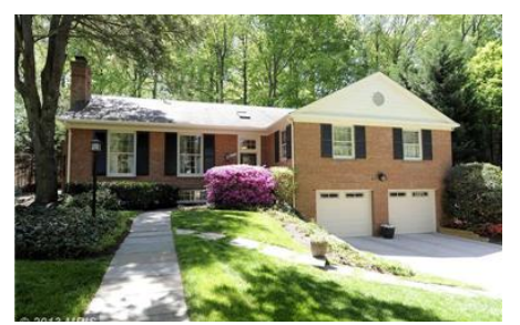
5506 Jordan Rd $1,159,000