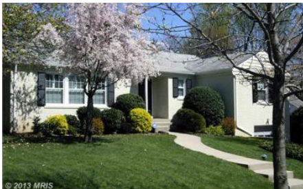
5709 Ogden Rd $995,000