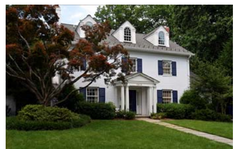
Pending 5606 Albia Rd. listed 1,450K