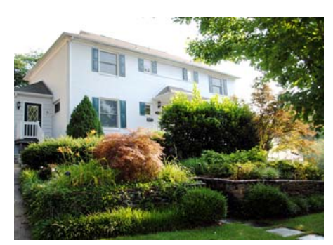
5606 Jordan Rd $1,175,000