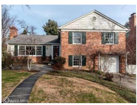
5613 Newington Rd $1,150,000